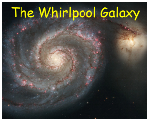
The Whirlpool Galaxy

When we are in the full flow with our daily lives, it is so easy to forget that God the creator of the universe is in control of every, apparently insignificant detail of our lives and as we heard at Wave this year "It's all for His glory" and we are all part of a much greater story.